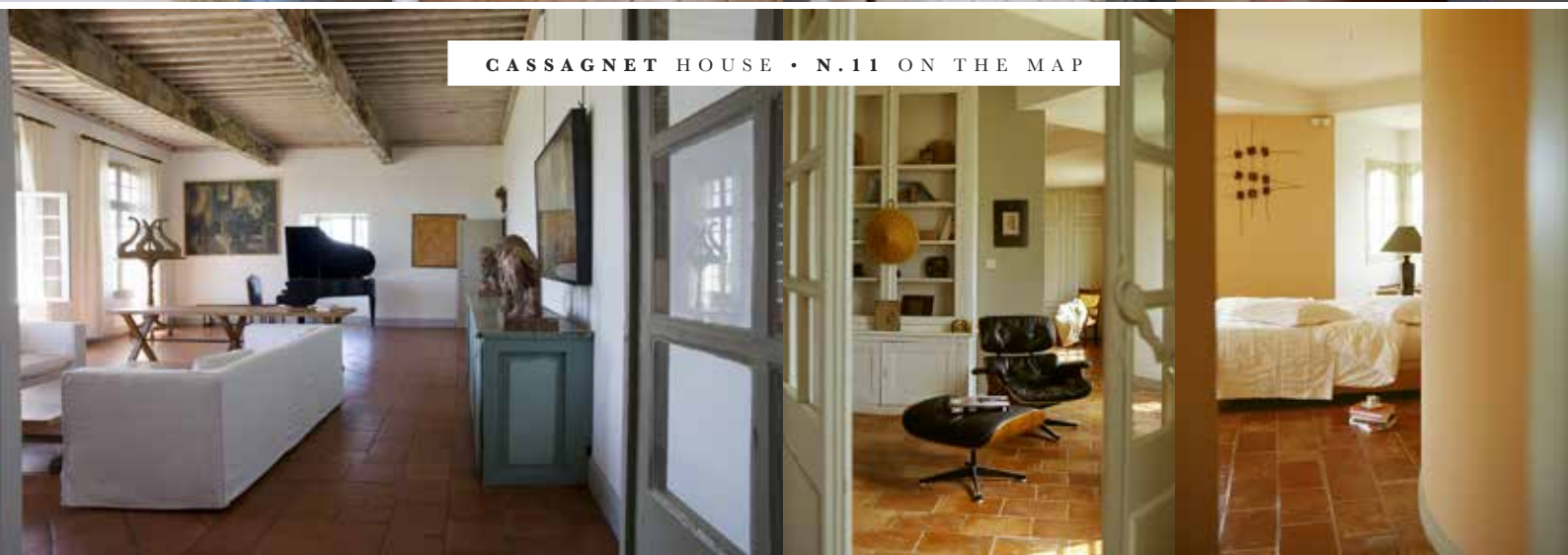
CASSAGNET HOUSE • N.11 ON THE MAP