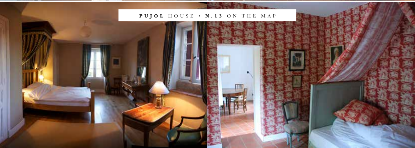
PUJOL HOUSE • N.13 ON THE MAP