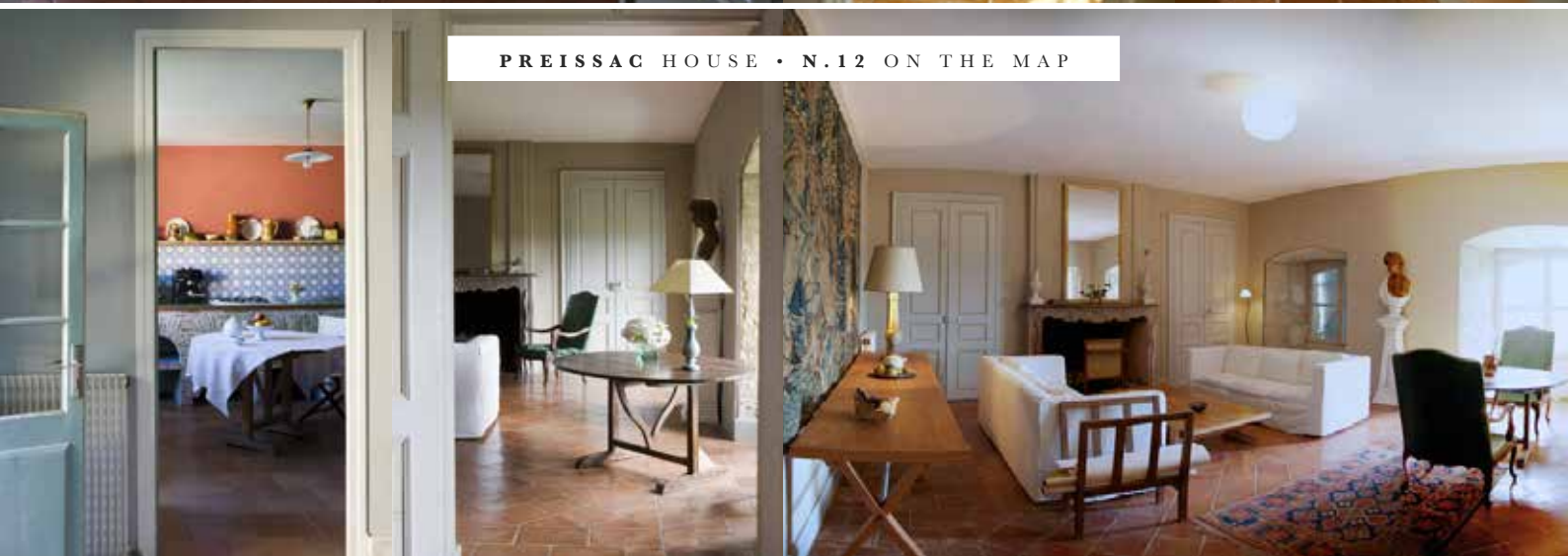
PREISSAC HOUSE • N.12 ON THE MAP