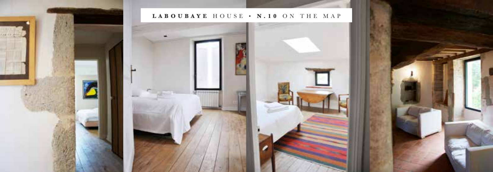
LABOUBAYE HOUSE • N.10 ON THE MAP